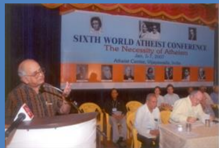
Dr. P.M. Bhargava, eminent scientist addressing the Sixth World Atheist Conference, 2007.