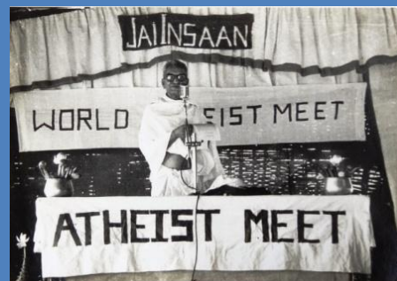
First World Atheist Meet 1972