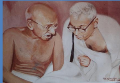
Conversations with Gandhi on Atheism 1945-46

Atheist Centre actively promote Article 51 A (h) of the Indian Constitution, which states in the Fundamental Duties that, 'It shall be the duty of every citizen of India to develop the scientific temper, humanism and spirit of inquiry and reform.'