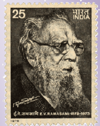
Periyar E.V. Ramasami (1879-1973) Founder of Dravidar Kazhagam, Tamil Nadu, India